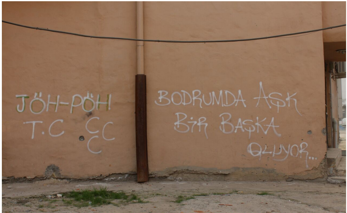
(GSO-PSO) - "Love in the basements is unique".

We see graffiti in the neighborhoods where the basement massacres took place: