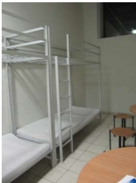
Warsaw Airport Center for Asylum Procedure, Prison cell

The excursion ended on a discussion about the new Dublin III regulation and the responsibility sharing mechanism within Europe. The visitors shared their view that the actual Dublin-System is not functioning properly and that there should be the freedom of choice within the EU to apply for asylum in a certain member state in order to consider the refugee's wish, family ties or knowledge of language. To balance potential asymmetrical asylum seeker reception within the EU states, there is the idea of an equalisation fund to distribute costs.