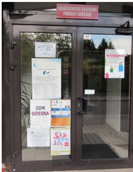
Family Support Center, Warsaw

In our discussions, we learned that because of these elementary conditions – being homeless and without any financial support - many refugees try to leave Poland to go to Western European countries.