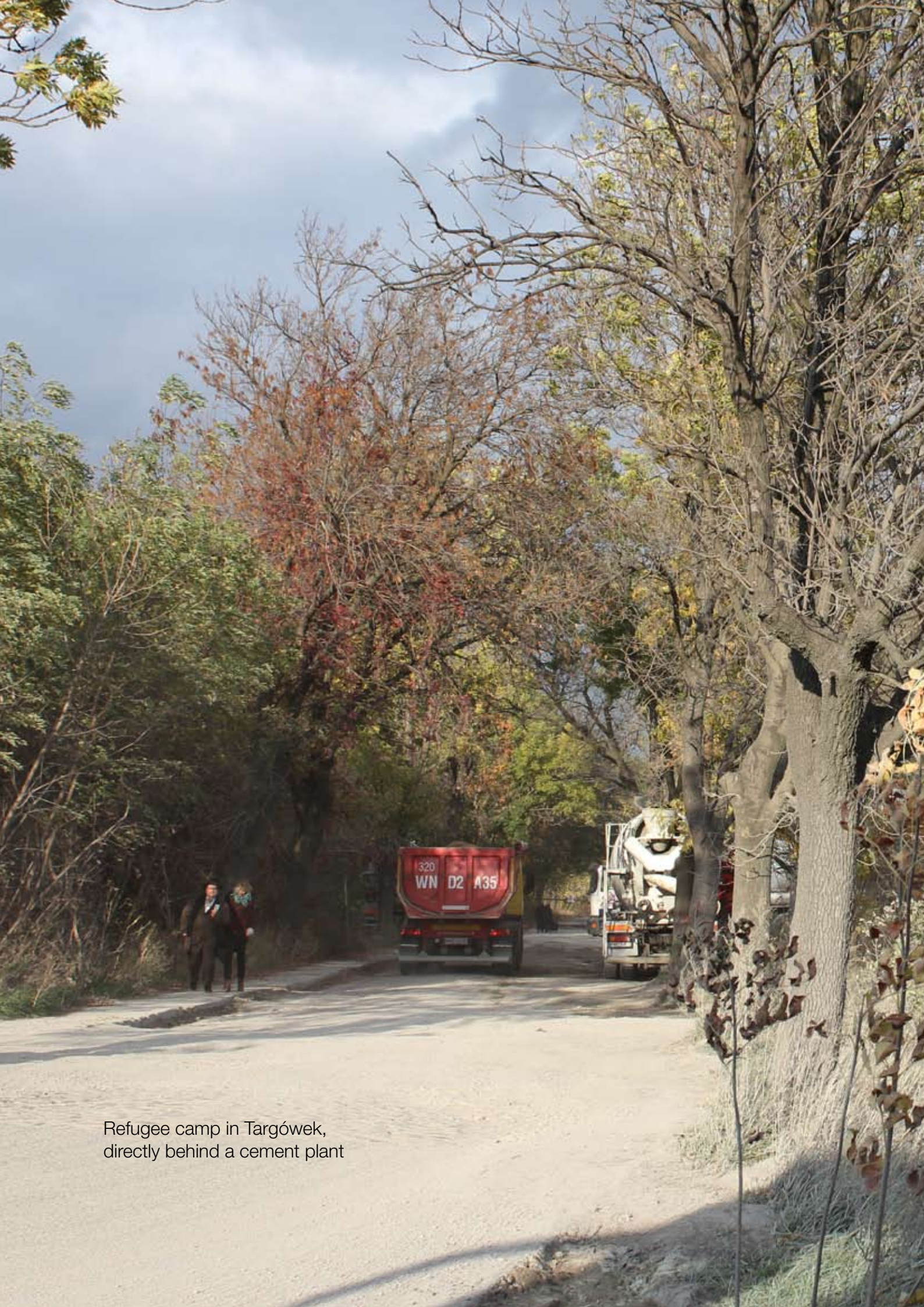
Refugee camp in Targówek, directly behind a cement plant