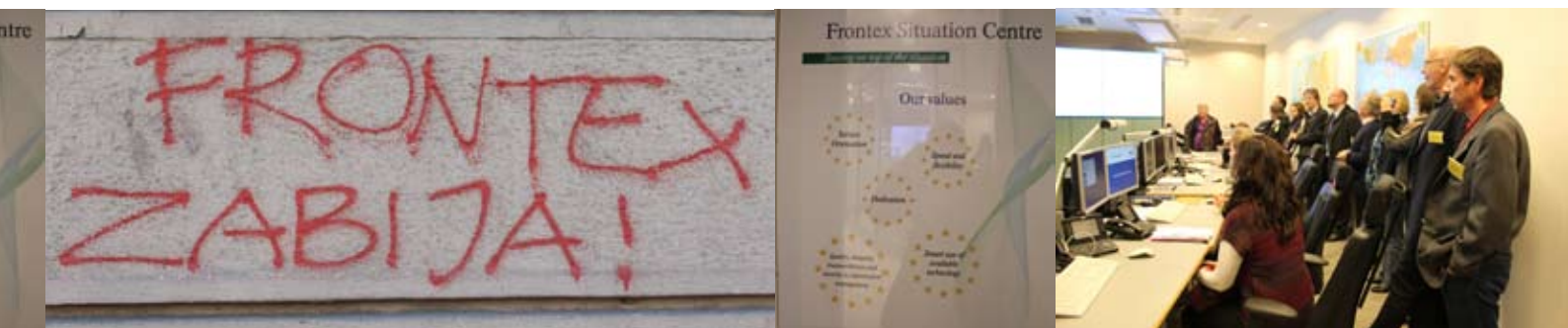
This Graffiti came across to the participants in the city centre of Warsaw.

Frontex is making much effort to further develop its technical capabilities and improve the border surveillance system. More and more own monitoring systems, be they radar or satellite-based, or via aerial vehicles. Establishing these systems will also lead to more responsibility in the field of refugee protection, especially concerning vessels in distress that try to reach the coast of the EU. In addition, Frontex will move to new premises in Warsaw in 2015.